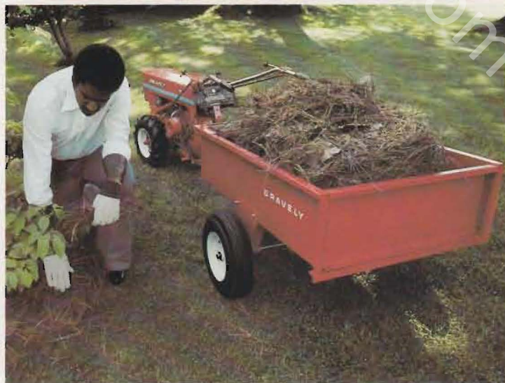
Top: Gravely 5260, 8 hp Convertible Tractor with All-Gear Drive Rotary Plow. Bottom: Gravely 5260, 8 hp Convertible Tractor with All-Steel Hauling Cart.

plowing, you can use your rotary plow for terracing, hilling and even ditching.