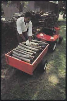
8123 12 HP Tractor with Utility Cart