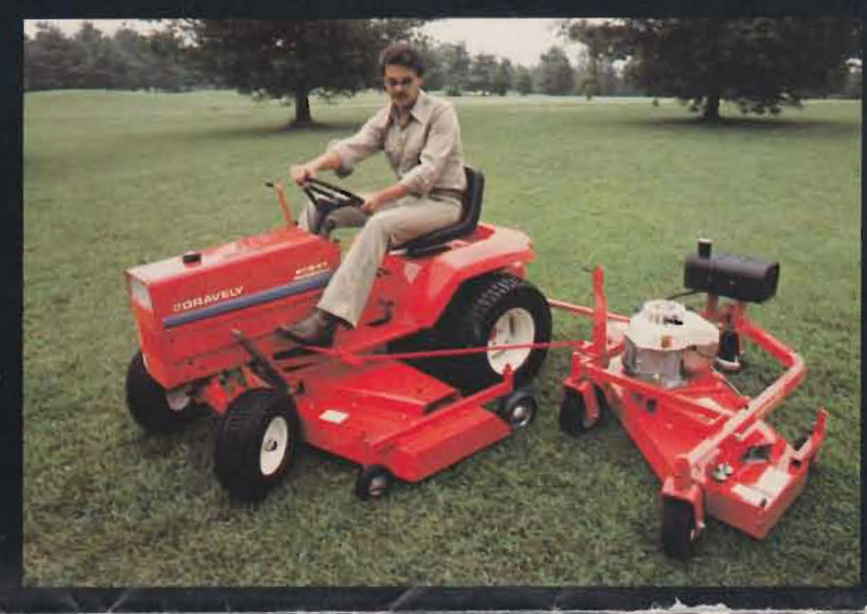
Above: 8179-KT 17 HP Tractor with 60" Mowing Deck and 40" Wing Mower Top Left: 48" SnowDozer Center Left: 8179-KT 17 HP Tractor with 44" Power Brush Bottom Left: 8179-KT 17 HP Tractor with Center Mount Scraper Blade