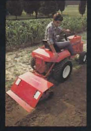
8123 12 HP Tractor with Rear Tiller