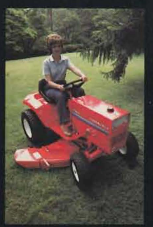
8163-B 16 HP Tractor with 50" Rotary Mower